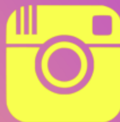
PHOTO / VIDEO SHARING

When people use -filters on their photos on Instagram, it can set unrealistic expectations and create feelings of inadequacy and low self-esteem in children. Children may strive for a comparable number of 'likes' to an unrealistically edited image. This runs the risk of drastically lowering your child's confidence or sense of self-worth.